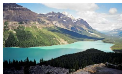
Peyto Lake - Icefields Hwy