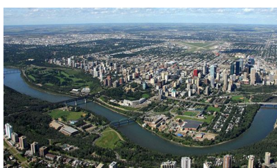
North Saskatchewan River