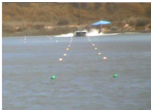
Not enough zoom and image too grainy