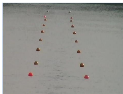
Edges of the monitor not visible camera to high