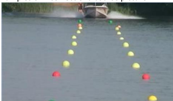
Edges of the monitor not visible