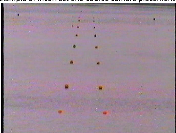
Camera too high and not enough zoom

Example of incorrect end course camera placement