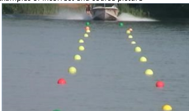
Edges of the monitor not visible