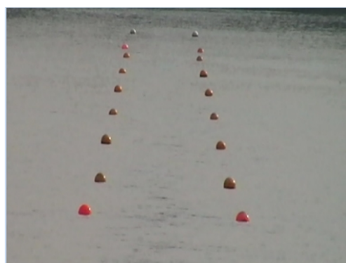
Edges of the monitor not visible camera too high