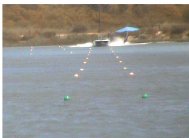
Not enough zoom and image too grainy