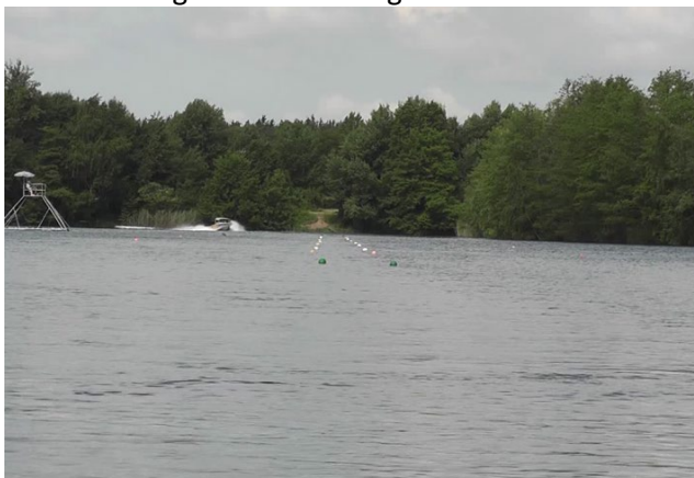
Not enough zoom