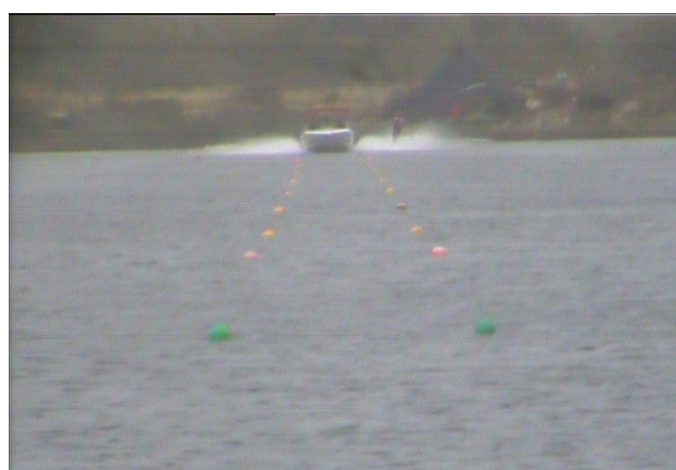
Not enough zoom and image too grainy